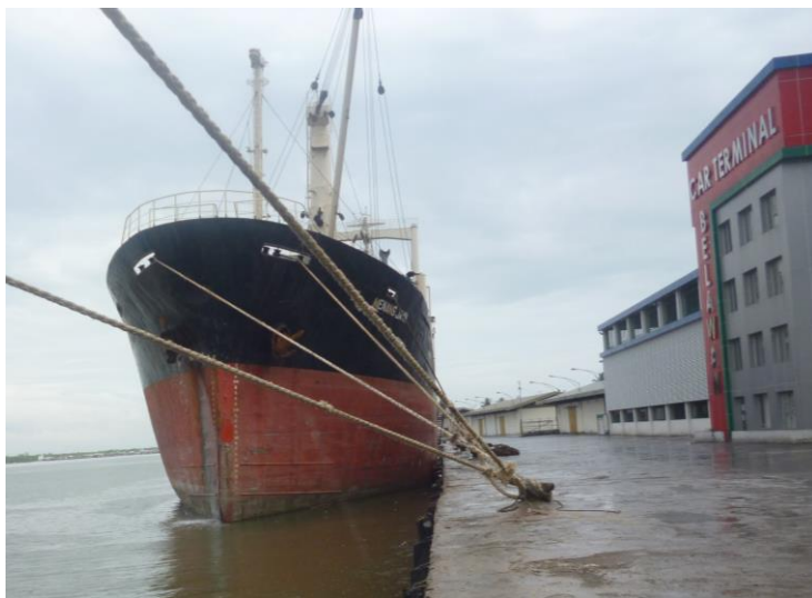
Cargo and Draft Survey